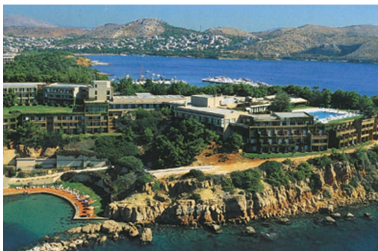
Scene of the crime: The Nafsika Astir Palace Hotel.

“Generally speaking, the transnationalists tend to emphasize the interdependence between the United