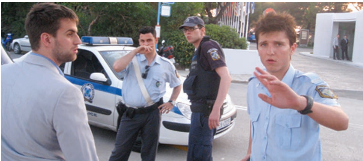
Above, Greek police demand a reporter’s camera and notes.

“We know we need to take action,” Bildt said of global warming. “The global crisis is now,” he said. “The necessity to take action on climate change is now.” His calls for “global action” on these supposed “crises” were thinly disguised calls for UN control. Bildt called for world (UN) solutions to virtually all problems. He cited the European Union as “model of integration, saying, “the