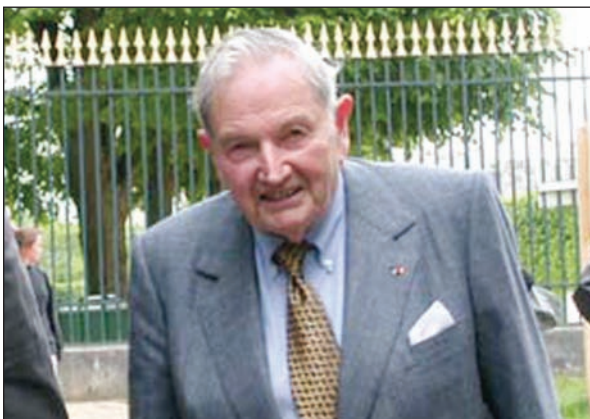
How many more Bilderberg meetings does billionaire David Rockefeller have left in him? Is there a new generation of Bilderbergers being groomed for the future?

Europeans are fighting world government and illegal immigration harder than Americans because they are better informed. Most European cities have many daily newspapers that are pricey—they rely less on advertising and tend to be independently owned. That’s why they dare to publish heavy coverage of Bilderberg’s meetings. Now, more than ever, nationalist patriots across the world are opposing Bilderberg.