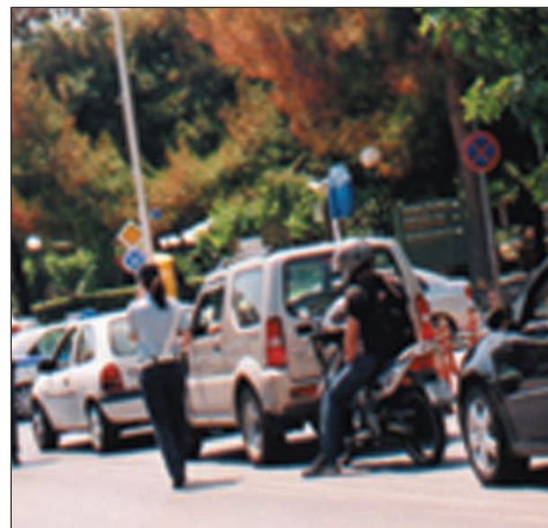
Every car and every passenger were checked by the Greek police making for traffic jams and lengthy delays for tourists, visitors and journalists.

The Post obediently backed Bilderberg's call for