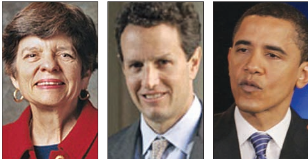
ALICE RIVLIN TIM GEITHNER BARACK OBAMA

Rivlin confirmed that once again, world government was at the top of the discussion list at this year's Bilderberg meeting along with the replacement of the dollar as the world's currency.