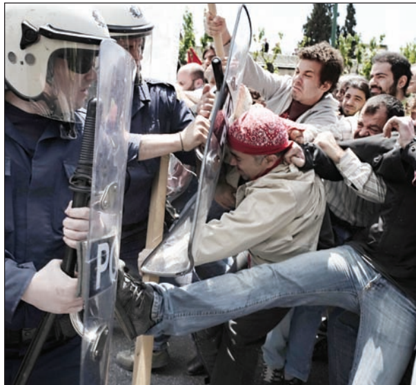
Greeks protest illegal immigrants. There are an estimated 250,000 illegal immigrants in Greece—the majority of which are ethnic Albanian Muslims.

Greeks began playing rough after immigrants in Athens attacked police with rocks and bottles, thinking police had defaced a Koran, the Muslim bible that