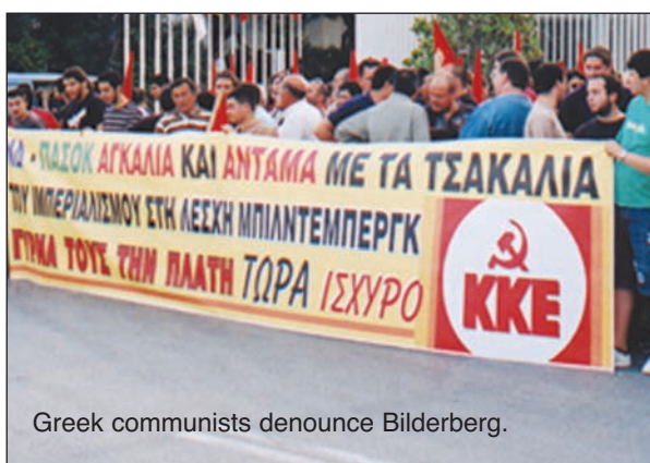
Greek communists denounce Bilderberg.

Police seized many newsmen, most of them several